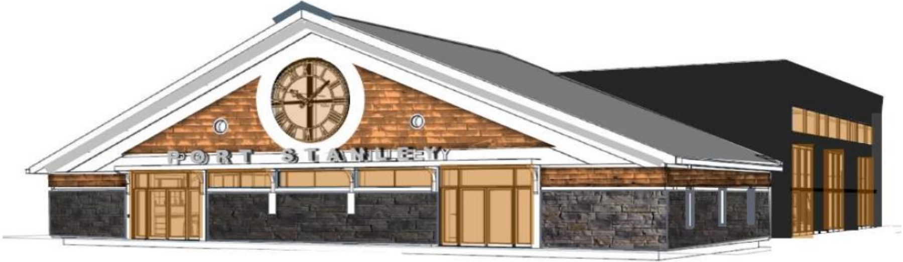
Figure 2a – Proposed Port Stanley Fire Station