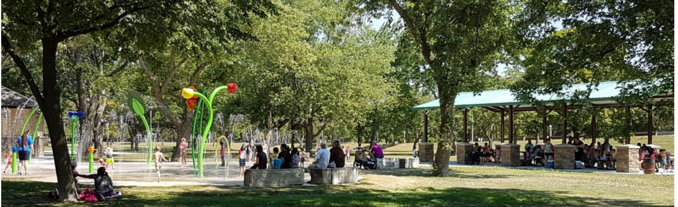
A park with trees, shade structure and splash pad in Windsor.